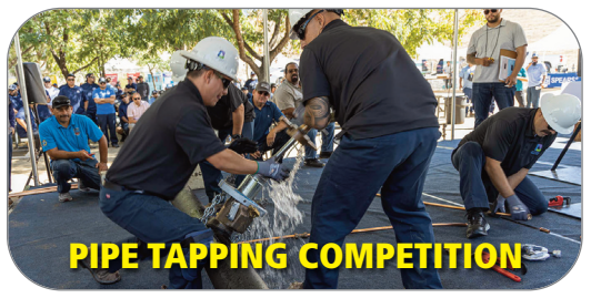
PIPE TAPPING COMPETITION