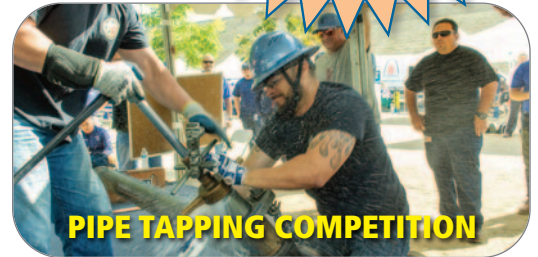
PIPE TAPPING COMPETITION