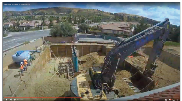
Click the image above to view a video of the Fairmont Booster Pump Station construction.

For a look into the development and construction of this award-winning project, check out this exceptional video on YouTube: